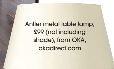
Antler metal table lamp, £99 (not including shade), from OKA, okadirect.com