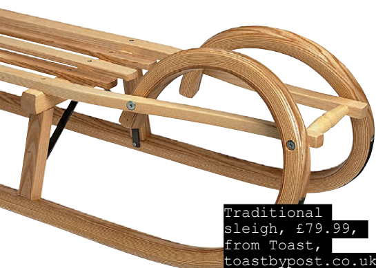
Traditional sleigh, £79.99, from Toast, toastbypost.co.uk