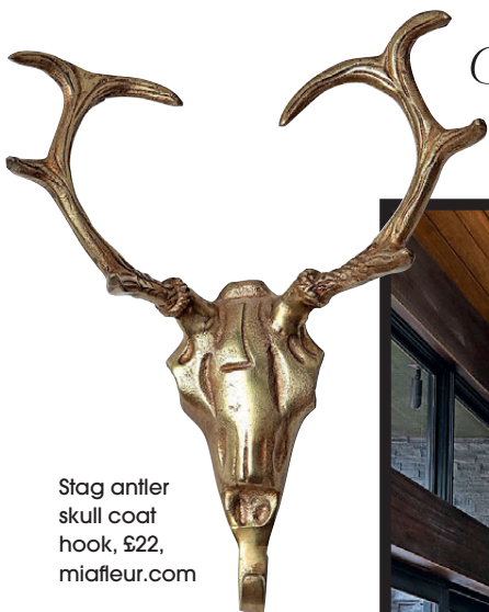
Stag antler skull coat hook, £22, miafleur.com