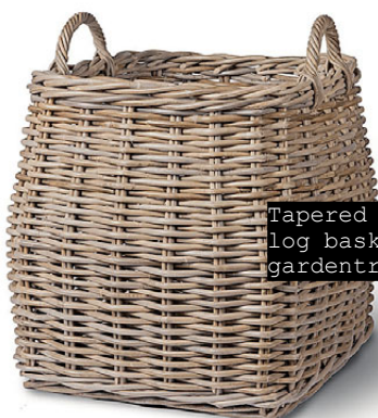
Tapered rattan log basket, £70, gardentrading.co.uk