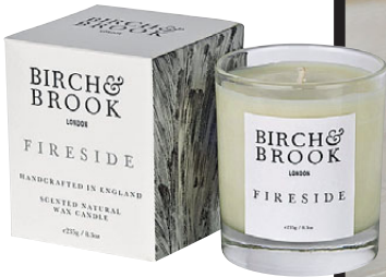
Birch & Brook fireside candle, £36, roullierwhite.com

For more interiors inspiration visit theresident.co.uk