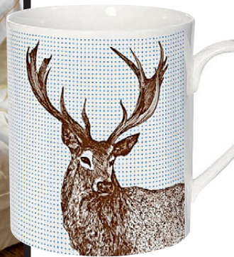
Bone china stag mug, £10.95, cherithharrison.com