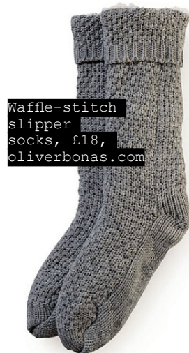
Waffle-stitch slipper socks, £18, oliverbonas.com