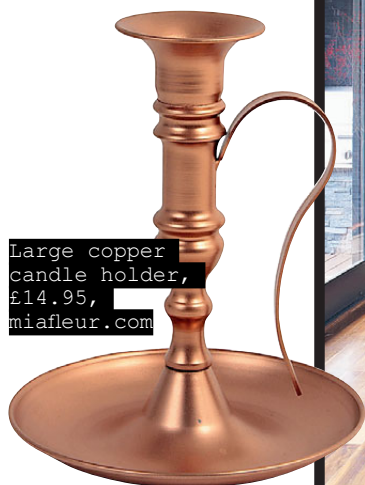
Large copper candle holder, £14.95, miafleur.com